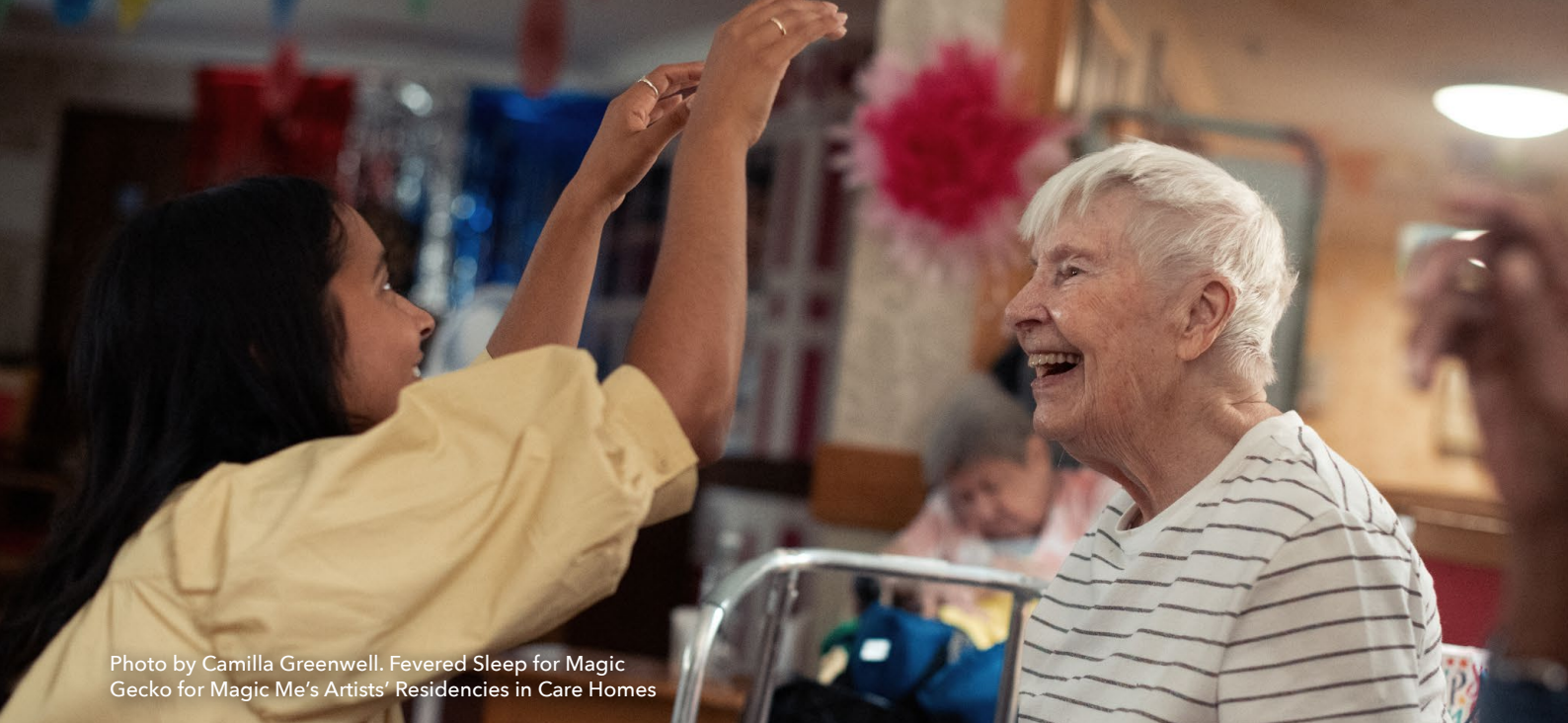
Fevered Sleep for Magic Gecko for Magic Me's Artists' Residencies in Care Homes