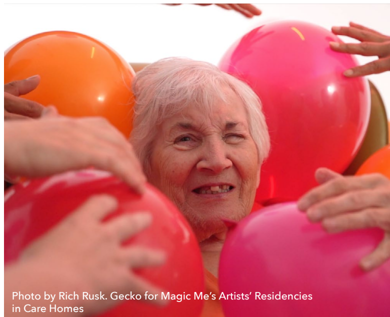
Gecko for Magic Me's Artists' Residencies in Care Homes

Set up a dedicated art group and explore different art forms, using online resources to help you. Explore a different art activity every month; visual arts, creative writing, drama, dance and crafts.