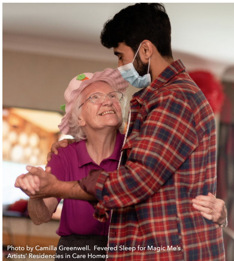
Fevered Sleep for Magic Me's Artists' Residencies in Care Homes

It is necessary to move away from the output/product being the only sign of success when creating art – the process is just as important and interesting. However, people