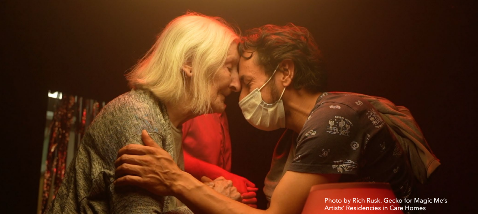
Gecko for Magic Me's Artists' Residencies in Care Homes